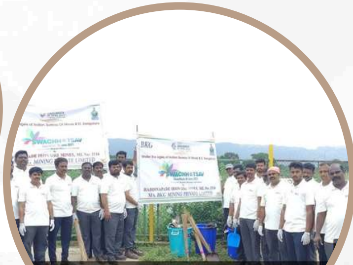
Sandur, Karnataka, India

+gpgq Baithul Jannah Residence, Sandur, Karn 90178° Long 76.535837° 10:53 AM GMT +05:30