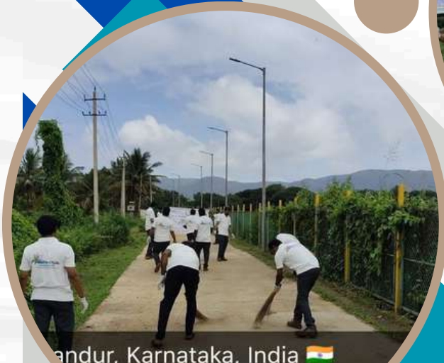
Sandur, Karnataka, India

+gpgq Baithul Jannah Residence, Sandur, Karn 90178° Long 76.535828° 11:10 AM GMT +05:30