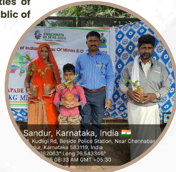
Sandur, Karnataka, India 1, Kudligi Rd, Beside Police Station, Near Chennabas ur, Karnataka 583119, India 082063° Long 76.543346° 05:08:33 AM GMT +05:30