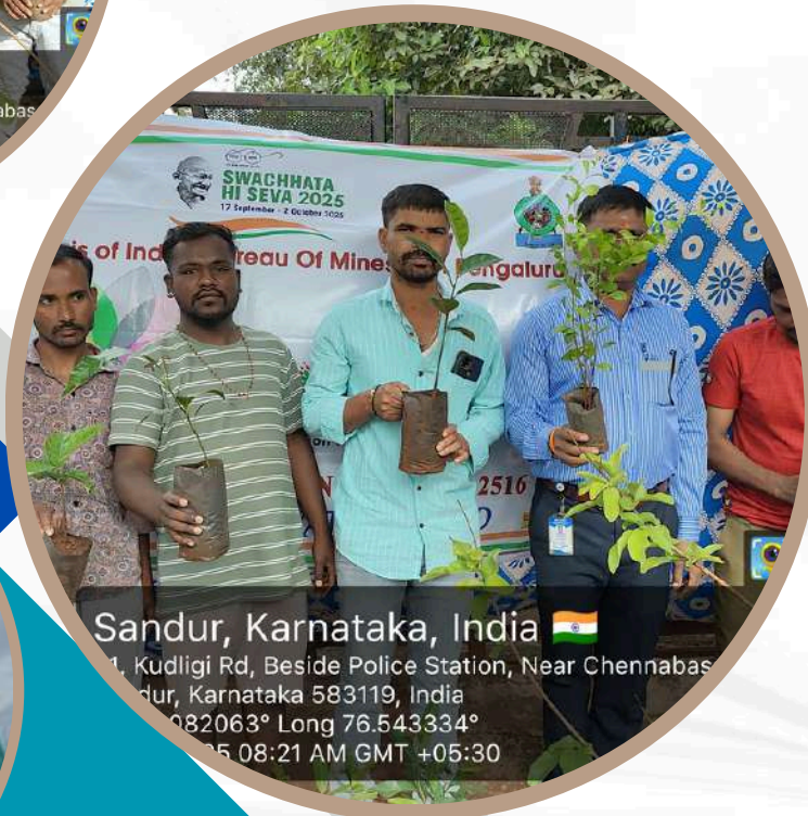
Sandur, Karnataka, India 1, Kudligi Rd, Beside Police Station, Near Chennabas ur, Karnataka 583119, India 082063° Long 76.54334° 05:08:21 AM GMT +05:30