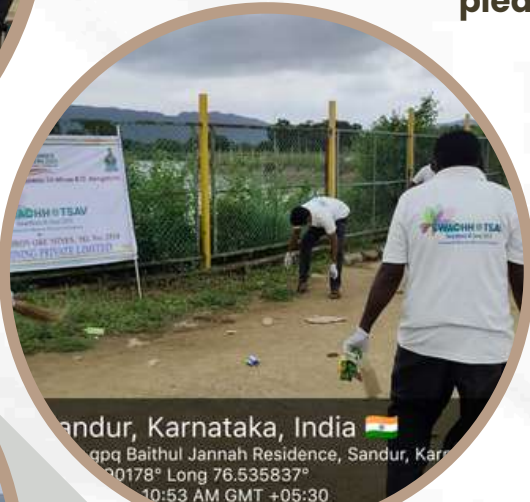
Sandur, Karnataka, India

+gpgq Baithul Jannah Residence, Sandur, Karn 90209° Long 76.535831° 10:55 AM GMT +05:30