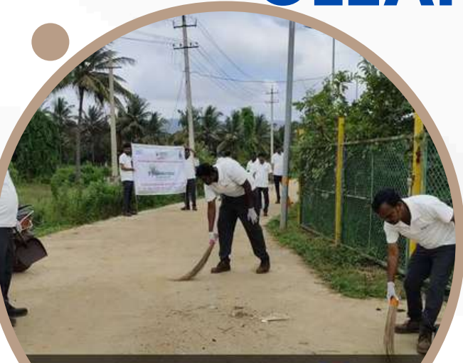
Sandur, Karnataka, India

The objective of this Cleanliness campaign was to contribute to the cleanliness and aesthetics surrounding of Shivapura Kere park, Sandur, making the area more pleasant and hygienic environment.