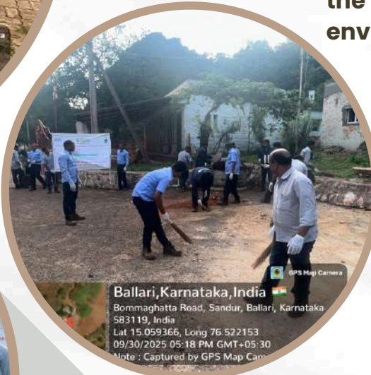
Ballari, Karnataka, India Bommaghatta Road, Sandur, Ballari, Karnataka 583119, India Lat 15.059366, Long 76.522153 09/30/2025 05:18 PM GMT+05:30