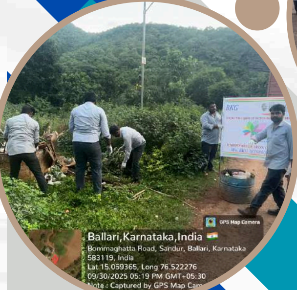
Ballari, Karnataka, India Bommaghatta Road, Sandur, Ballari, Karnataka 583119, India Lat 15.059365, Long 76.522276 09/30/2025 05:19 PM GMT+05:30 Note : Captured by GPS Map Cam