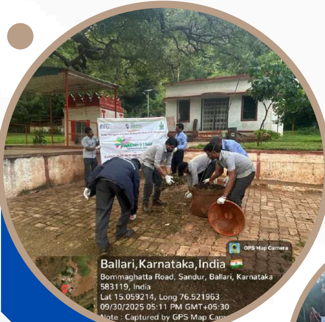
Ballari, Karnataka, India Bommaghatta Road, Sandur, Ballari, Karnataka 583119, India Lat 15.059214, Long 76.521963 09/30/2025 05:11 PM GMT+05:30 Note : Captured by GPS Map Cam

The objective of this Cleanliness campaign was to contribute to the cleanliness and aesthetics surrounding of Shri Gandhi Narasimha Swami Temple Sandur, making the area more pleasant and hygienic environment.